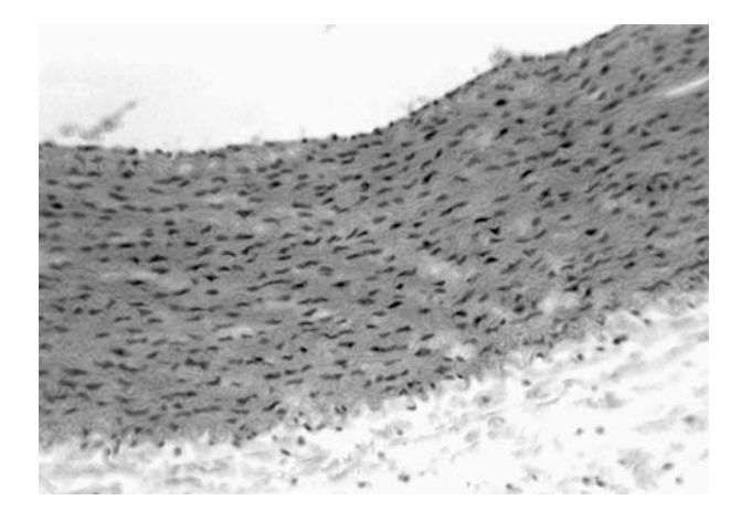
Figure 1. Thoracic aorta tissue of a control rabbit (C) The thoracic aorta tissue of the control group is without atherosclerotic changes.

Figure 1-3 shows the thoracic aorta tissue of rabbits.