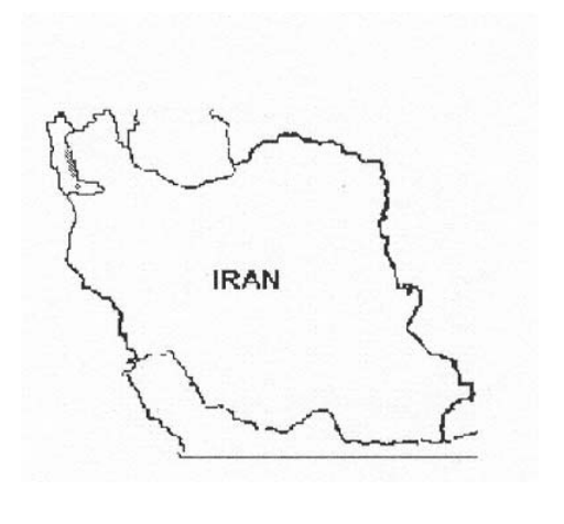
Figure 1. Map of the sampling areas in the Miandoab region, Iran