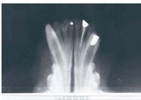
Figure 5. First central incisor after pulp capping: the apex has reached stage G. On the lateral incisor pulpotomy was performed at the point of radiographically visible point of immature root and filled with Silapex and gutapercha; the apex has matured to stage H. Pulpotomy at the e-c junction was performed on the canine; the apex growth has reached stage H