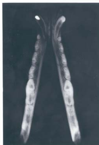
Figure 4. Lower left canine tooth 6 months after initial treatment: the root apex has matured to stage G; dentinal walls are thinner compared to the control tooth