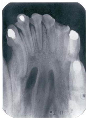
Figure 3. Direct pulp capping with Hap on second and third incisors. Apex growth is completed (stage G). Incomplete dentinal bridges are visible

Behap powder was applied on pulpal wound after the coronal part of the pulp was removed. Cavities were lined with glassionomer liners and filled with amalgam. As viewed on radiographs, root formation was completed in all tested teeth with the majority of both tested and control teeth being in the development stage "H" and physiological shapes. Dentin bridge formation was observed in 6 out of 8 tested teeth. There were no significant differences in 4 observed parameters compared to control teeth.