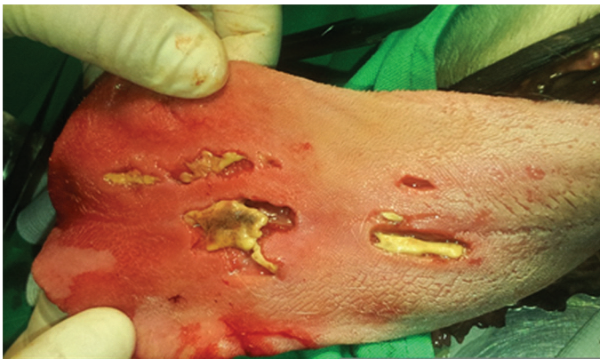
Figure 2. Pseudomembranous erosions, ulcerations and necrotic areas of the tongue

To cause NF and later streptococcal toxic shock syndrome, bacteria presumably have to invade fascial tissues through (minor) wounds/trauma such as bite wounds, surgical trauma and skin infections [11] although NF was reported also after dental treatment [14]. Affected animals develop fever, lethargy, rapidly progressing cellulitis associated with an intense pain localized around the affected area [9]. In the case presented here, in addition to S. canis , P. multocida and S. pseudintermedius were also isolated from both the oronasal fistula and the lungs. Both bacteria are also commensals in dogs, may cause severe soft tissue monoinfections including NF, but reports on this are rare [15, 16]. The exact role of the three bacterial species isolated from our patient is not clear, but their synergistic activity is possible, resulting in a rapidly progressing disease. Further, streptococci are generally sensitive to penicillin, but when large numbers of slow-growing bacteria are present, antibiotic may be less effective because of the