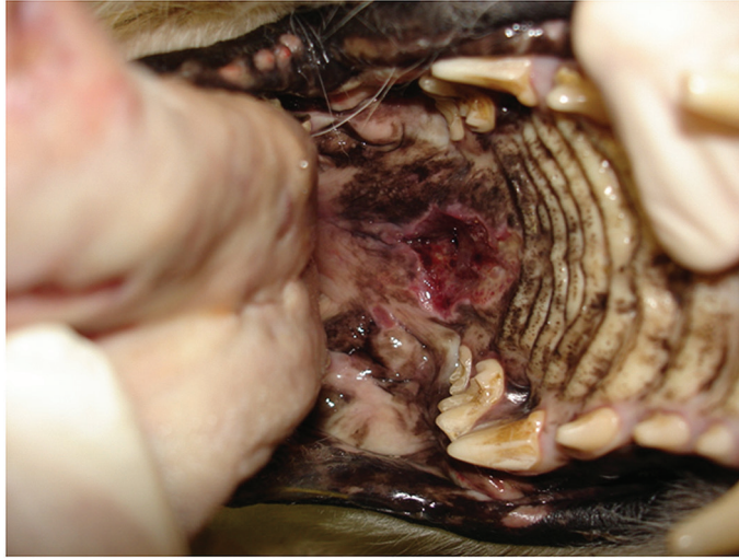
Figure 1. Oronasal fistula