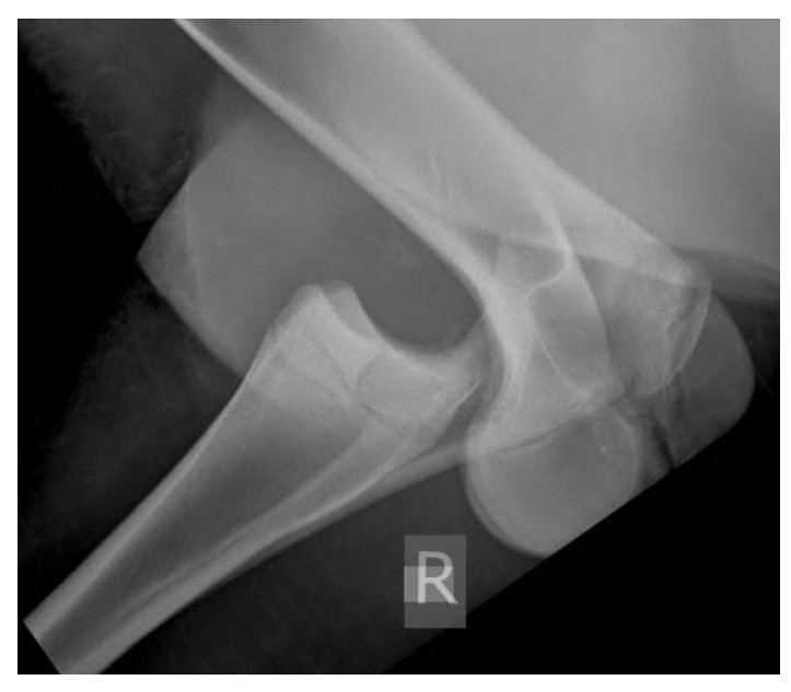
Figure 3. Lateromedial projection of luxated right elbow joint