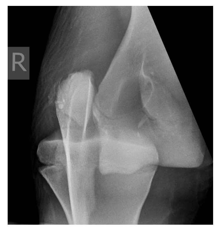
Figure 2. X-ray imaging in craniocaudal projection shows right elbow joint luxation