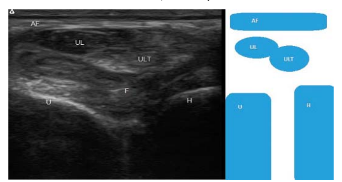
Figure 6. Transverse image with corresponding diagram of the lateral cubital region. AFantebrachial fascia; ULT-tendon of the ulnaris lateralis muscle; UL-ulnaris lateralis muscle; U-ulna; H-humerus; F-fluid accumulation. Lateral is to the left.

Figure 5. Sagittal image with the corresponding diagram of the lateral cubital region. AFantebrachial fascia; UL-ulnaris lateralis; ULT-tendon of the ulnaris lateralis muscle U-ulna; H-humerus; F-fluid accumulation within the join cavity. Proximal is to the left.