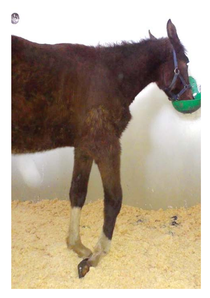
Figure 1. Non weight bearing lameness of the right forelimb with the limb held in semiflexion with a dropped elbow position.

region are presented in Figures 4.-6. Surgical therapy was proposed, but considering the poor prognosis for athletic soundness, the owner opted for euthanasia. Necropsy findings revealed extensive subcutaneous edema of the elbow region, as well as 10 cm around the joint, noted from the outside. On the surface cut, accumulation of extracellular, yellowish, transparent fluid was present as a gelatinous layer 3-5 mm thick between the superficial and deep fascial surfaces from the shoulder to the carpal joint. The integrity of the elbow joint was disrupted and dark red blood coagulum was found covering the distal and lateral humeral epiphysis as well as proximal and lateral radial and ulnar epiphyses. Olecranon was positioned outside of its physiologic location; it was found 3 cm dorsally and laterally from the usual location in the elbow joint. Collateral ligaments of both medial and lateral sides were ruptured and the synovial cavity was filled with dark red, gelatinous, coagulated blood (Fig. 7). The diagnosis of medial humeral luxation with subsequent hemarthros was confirmed.