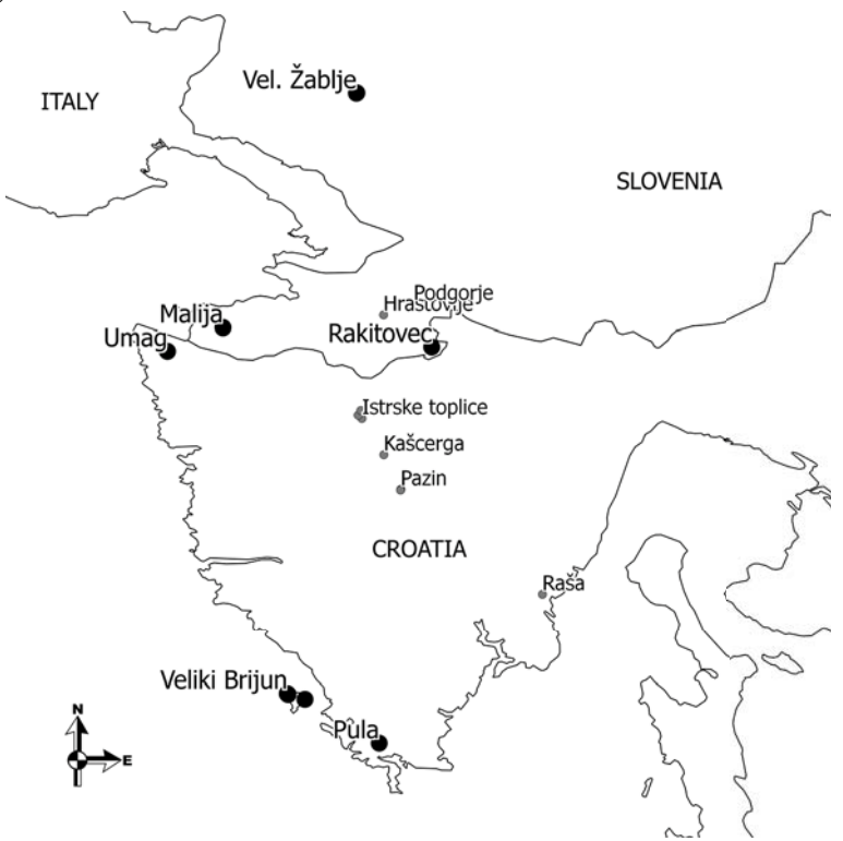
Figure 1. Map of the Istrian peninsula showing locations of investigated illegal waste sites (•positive sandflies sites; •negative sandflies sites)

The study was conducted on the Istrian peninsula, which is the largest region on the Adriatic Sea located in its Northeastern part and includes portions of Croatia, Slovenia and Italy. The climate of the region is Mediterranean and Sub-Mediterranean with dry and warm summers and mild winters. The average annual air temperature along the northern coast is around 14°C and 16°C in the southern area and islands. It snows very rarely. The entomological and rodent surveys were carried out at selected and marked illegal waste sites along the study area between April 2011 and May 2013 (Figure 1).