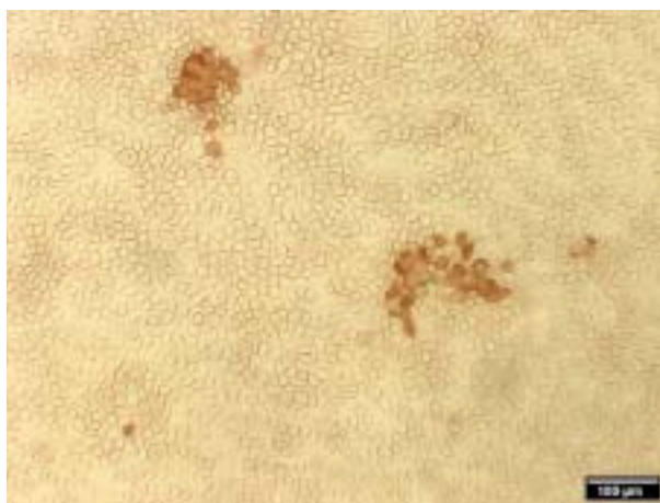
Figure 1. IPMA staining. PRRSV antigens (brown staining) within the cytoplasm of MARC-145 cells. Cells were seeded in 96-well cell culture plates, inoculated with 50 \mu l of PRRSV (Lelystad, Lena or VR-2332) and incubated for 18h (37°C, 5% CO 2 ). Then, the culture medium was removed, and cells were washed in PBS and dried at 37°C for 1h. The plates were kept at -70°C until use. Plates were thawed and then fixed in 4% paraformaldehyde for 10 min. The paraformaldehyde was removed, the cells were washed twice with PBS and a solution of 1% H 2 O 2 in methanol was added. Plates were washed twice with PBS and serial dilutions of the sera were added. Sera were incubated for 1h at 37°C. Plates were washed three times with PBS plus 1% Tween 80 and 50 \mu l of 1/250 rabbit anti-swine IgG HRP-conjugated antibodies (Dako) was added to each well. After incubation at 37°C for 1h, plates were washed three times and 50 \mu l of a substrate solution of 3-amino-9-ethylcarbazole in 0.05 M acetate buffer, pH5, with 0.05% H 2 O 2 was added to each well, and incubated at room temperature for 20 min. Then, the reaction was blocked by replacing the substrate by acetate buffer and the results were determined by examination with a microscope