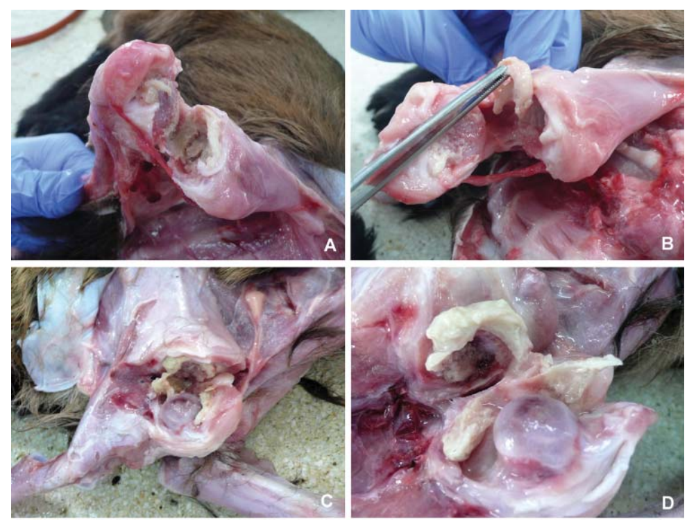
Figure 3. Fibrinous polyarthritis in different affected joints. a) Opened knee joint from Figure 1: Fibrinous exudate covers the articular surfaces. b) Abundant fibrinous mass is detached from articular surfaces of knee joint. c) and d) Hip joints with extensive fibrinous inflammatory exudate