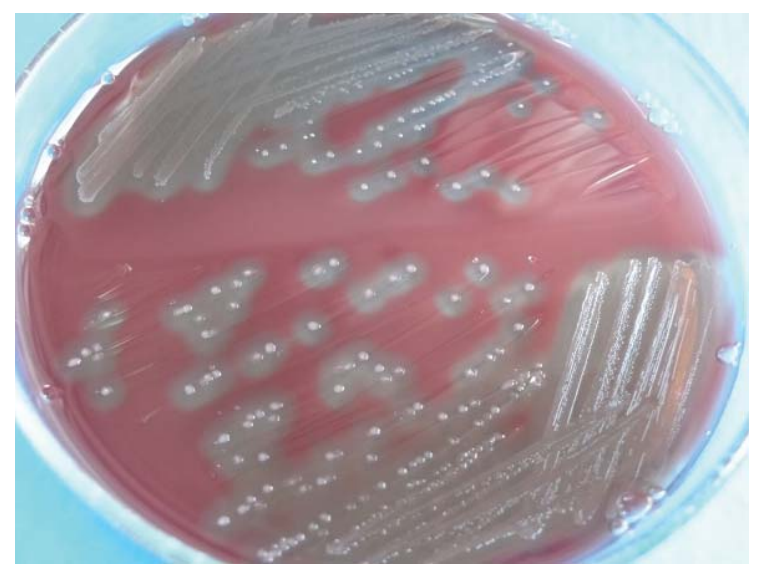
Figure 4. Growth of Streptococcus equi subspecies zooepidemicus on Columbia blood agar. Note presence of zone of beta hemolysis around colonies

Figure 3. Fibrinous polyarthritis in different affected joints. a) Opened knee joint from Figure 1: Fibrinous exudate covers the articular surfaces. b) Abundant fibrinous mass is detached from articular surfaces of knee joint. c) and d) Hip joints with extensive fibrinous inflammatory exudate