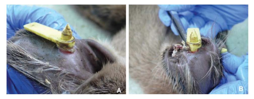
Figure 2. a) Crust beneath ear tag, b) Hyperemia of the edges of ear skin after removing of crust